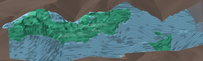
AuEq g/t Cut-Off Tonnes (000's) Ag g/t Ag ozs (000's) Au g/t Au ozs (000's) AuEq g/t AuEq ozs (000's) Total Indicated 0.20, 0.37, 1.50 26,847 21 18,026 0.51 444 0.77 661 Total Inferred 0.20, 0.37, 1.50 6,680 88 18,974 0.52 112 1.59 341