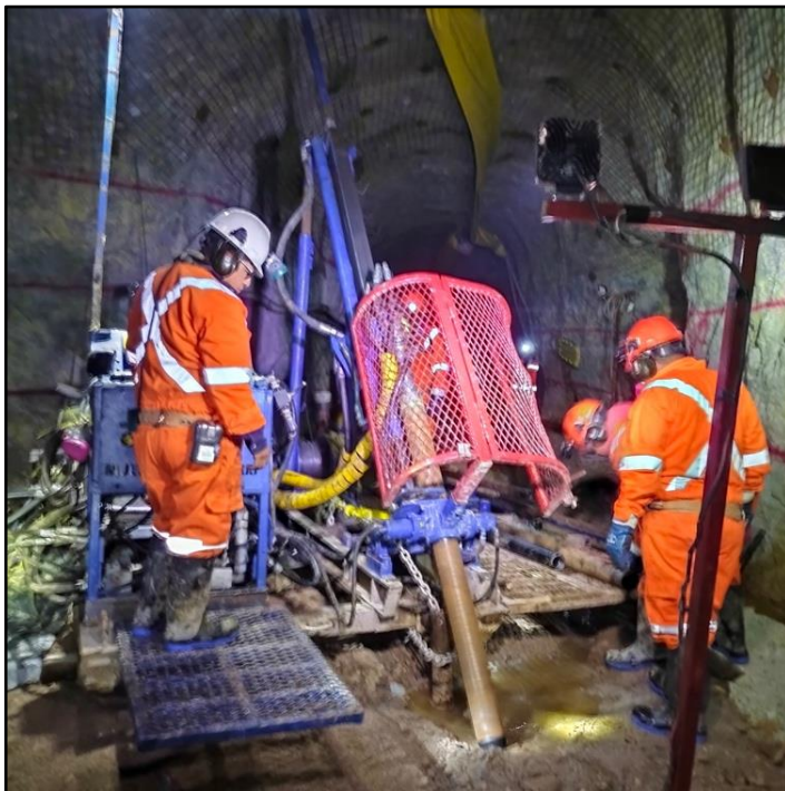
Figure 3 – Underground Drilling Operations in Progress at El Tigre Project

Silver Tiger expects to release the first drill results from its underground drilling campaign targeting the high-grade Veins, the Sulfide Zone and the Shale Zone in January 2025.